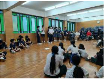
St. Margaret's School exchanges