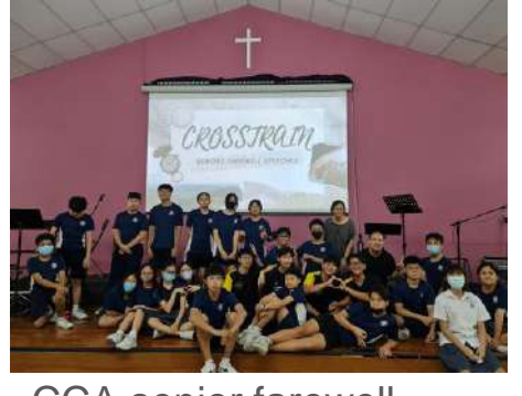
CCA senior farewell parties