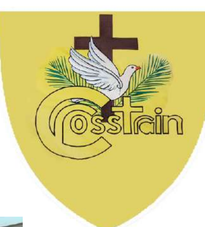
...and so much more!!!